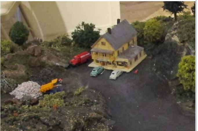
Close-up of Sophie's effort.