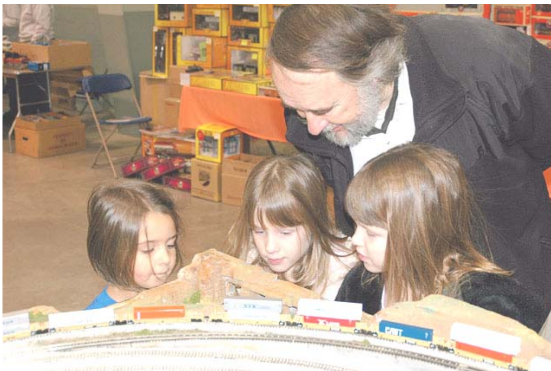
TRAIN WATCHING IN THE QUARRY AT YORK